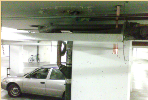
Drip Pan Secured in Place